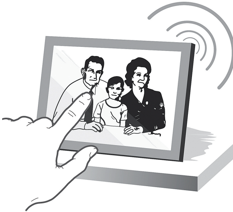
► Figure 2. The Families in Touch picture frame concept sketch.