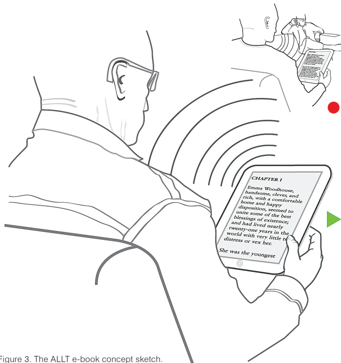
► Figure 3. The ALLT e-book concept sketch.

to identify and sustain conversation topics of common interest. In face-to-face interactions, this challenge is commonly resolved by engaging in a shared activity, such as playing a game, collaborating on a project, or even watching a TV program. Unfortunately, current communication technologies, such as the telephone and email, do not readily support these kinds of activities. We are beginning to explore the design of shared online activities, especially around the theme of family history.